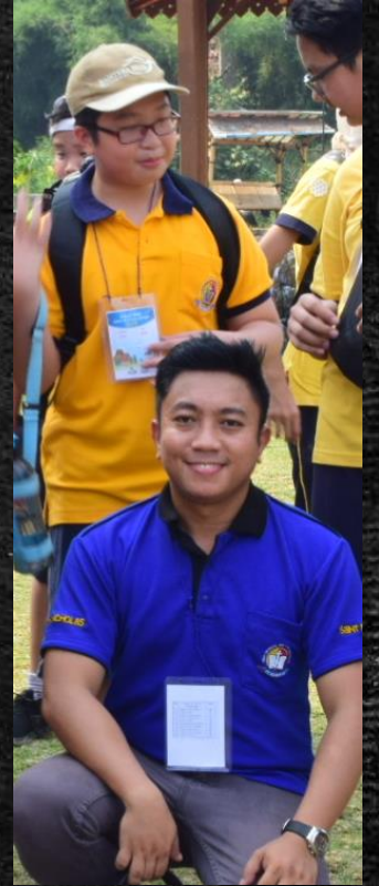
Inspire & Motivate